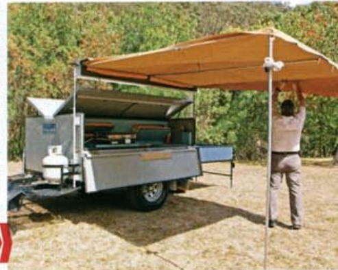
From far left to above: The awning is housed in an aluminium box and can be set up in about two minutes, once you get the hang of it.