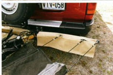
From top to above: A massive storage drawer is concealed at the rear of the trailer; sitting next to a water pump is a two-burner cooktop; bungee cord-enhanced stoneguard protection.