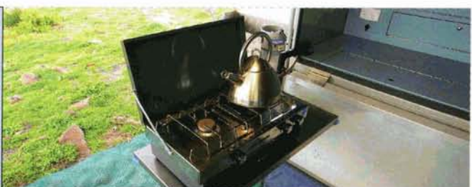
The stove is a stainless steel two-burner, complete with grill that hinges out on a sturdy steel leg before dropping and locking in to place. One of the best things about the Adventure way of doing things is that the kitchen and stove are accessible in around 15 seconds!