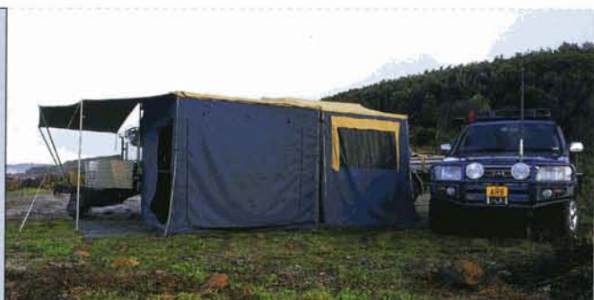
The Adventure layout offers a heap of options come set up time. You can open up the kitchen, swing out the cooker and roll out the self standing awning in less than a couple of minutes for a meal stop, or you can unfold the bedroom on it's own in four minutes. Full set up including two bedrooms, awning walls and a shade sail over the fridge takes about fifteen minutes tops. It has to, Paul Tabone likes a beer...

Sure, there was that night when we had to snatch-strap it to the 79 Series to slow the descent and there was the day we had to winch the '100 and trailer over the top of a loosely rocked hill. But the Adventure was with us the whole way and all up, its